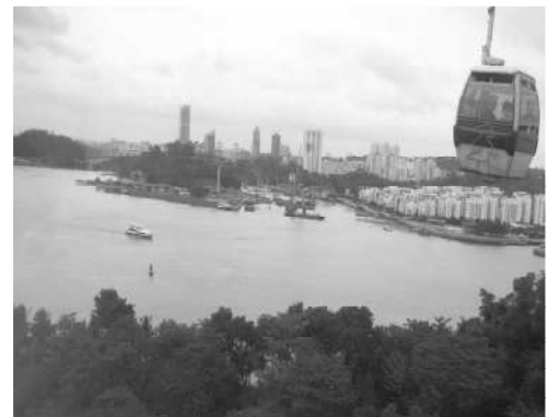
Singapore from cable car en route to Sentosa Island

Here I must admit to cultural clashes. First, really local food tends to be smelly, especially in an enclosed space. Next,